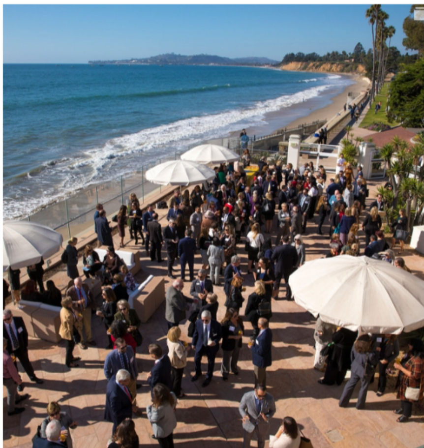
A networking reception at the Coral Casino in Santa Barbara prior to the 17th Annual Community Dividends Awards luncheon.